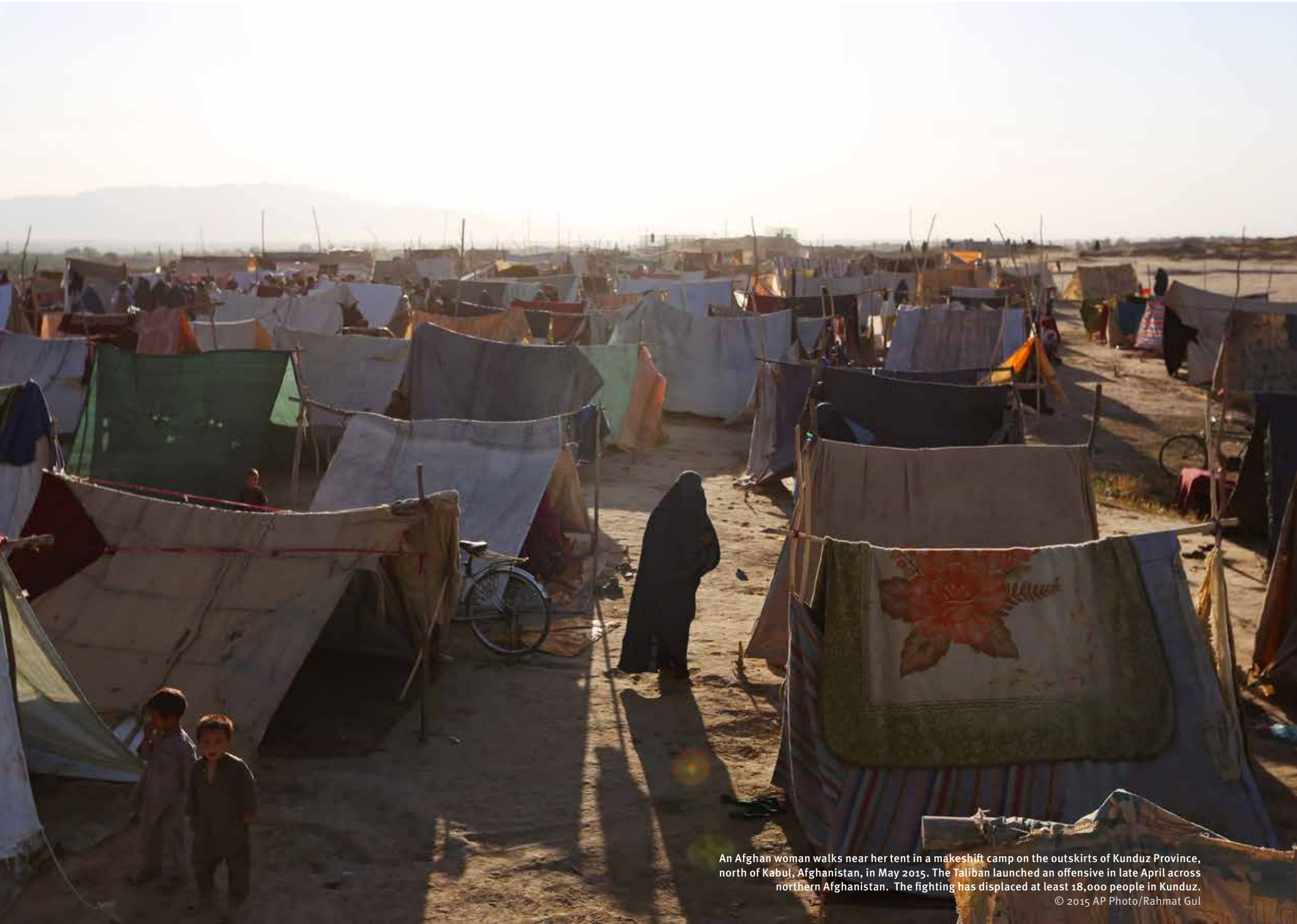
An Afghan woman walks near her tent in a makeshift camp on the outskirts of Kunduz Province, north of Kabul, Afghanistan, in May 2015. The Taliban launched an offensive in late April across northern Afghanistan. The fighting has displaced at least 18,000 people in Kunduz.