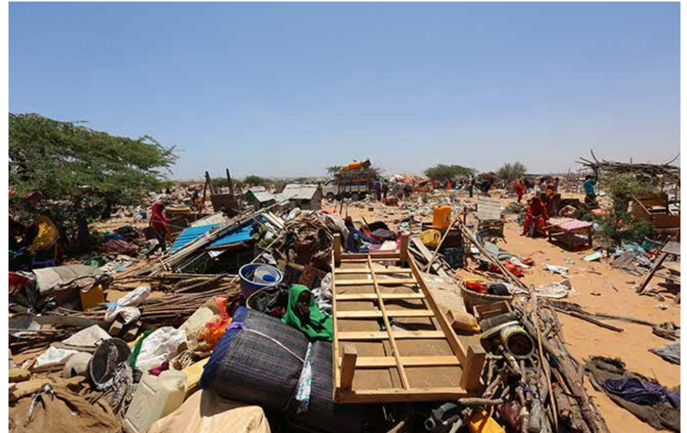
A child (left) surrounded by her family's belongings during the massive forced eviction by Somali authorities of a displaced person's camp in the Kadha (formerly Dharkenley) district of Mogadishu, Somalia on March 4, 2015.