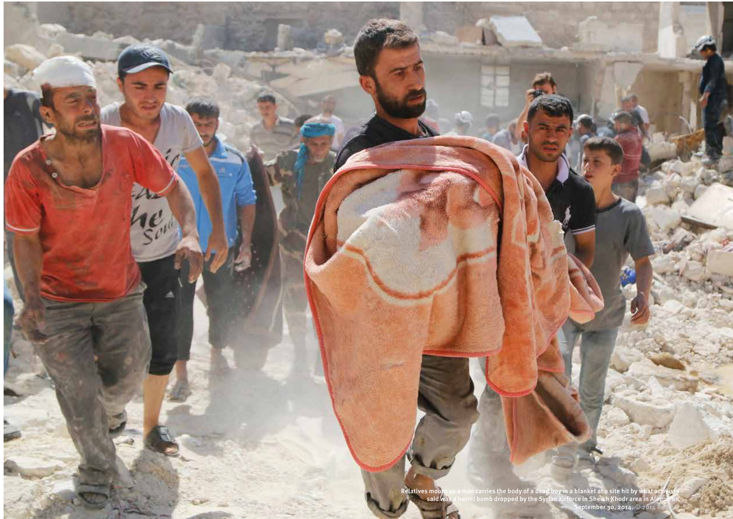
Relatives mourn as a man carries the body of a dead boy in a blanket at a site hit by what activists said was a barrel bomb dropped by the Syrian airforce in Sheikh Khodr area in Aleppo on September 30, 2014.