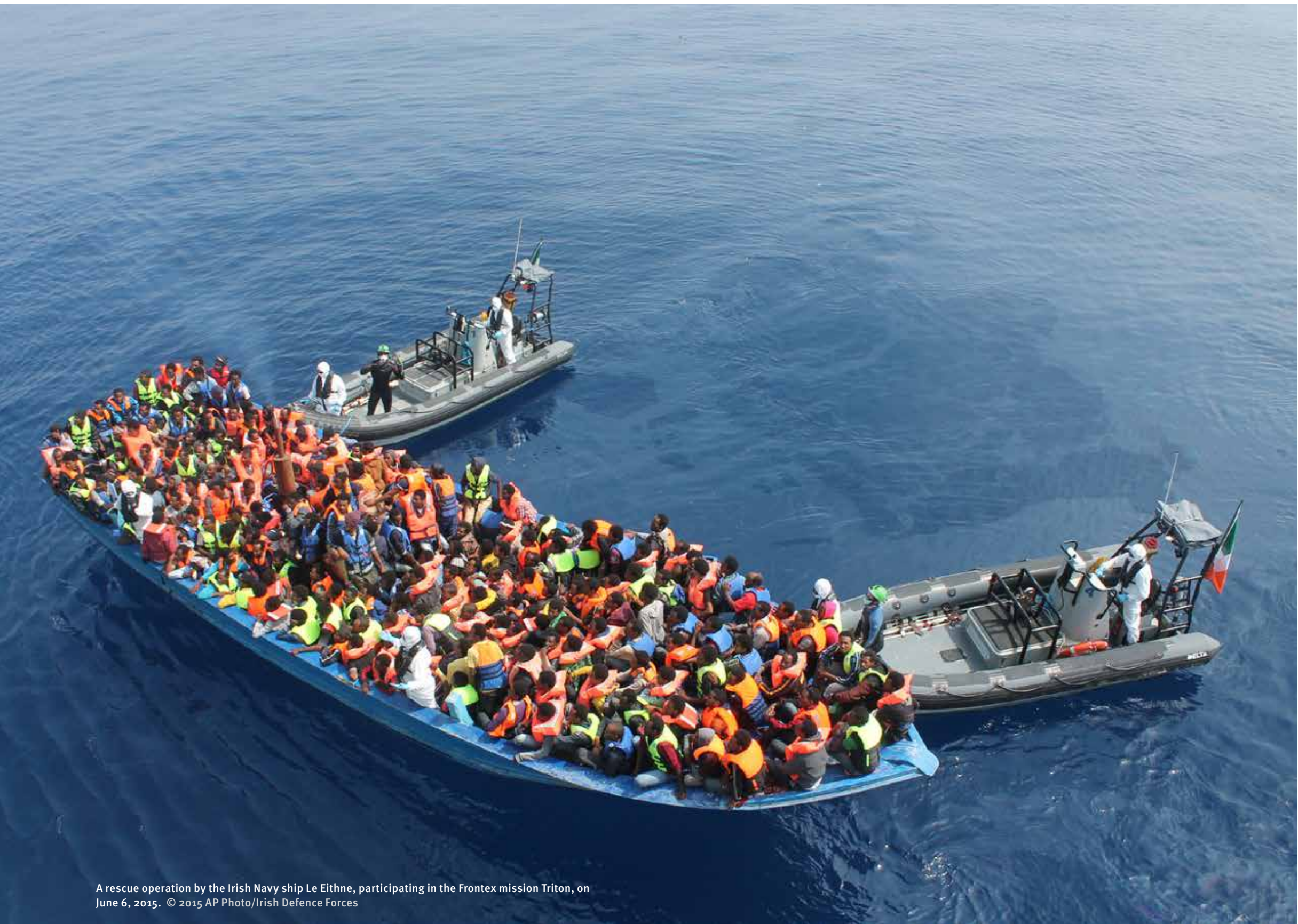
A rescue operation by the Irish Navy ship Le Eithne, participating in the Frontex mission Triton, on June 6, 2015.