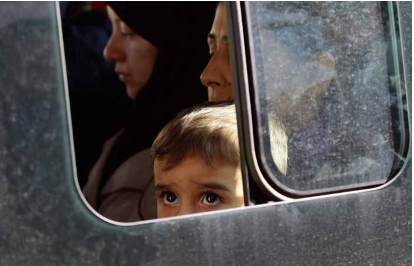
A child evacuated from a disabled cargo ship looks through a bus window, in Ierapetra on the Greek island of Crete November 27, 2014. A Greek frigate towed the cargo ship packed with 700 migrants to safety just off Crete.

Children are especially vulnerable. It is unknown how many children were among those who lost their lives trying to reach the EU between 2000 and 2014. According to Save the Children, children accounted for as many as 100 of the estimated 800 people who died in a shipwreck off the coast of Libya on April 19, 2015—the worst recorded incident. 65 In September 2014, approximately 100 children were among the 500 migrants who drowned in a shipwreck off the coast of Malta, according to witnesses. 66 When boats carrying migrants and asylum seekers capsize, children may be the most likely to drown.